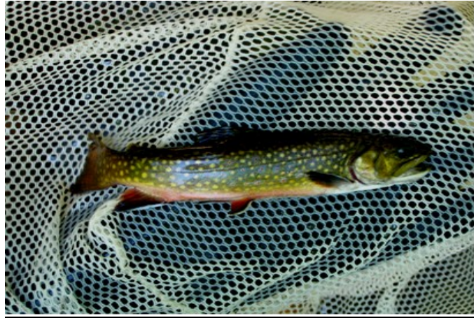
This mature brook trout is smaller than a stocked trout from a hatchery. Note the gloved hand under the net.

The findings to date show few structures that impede fish passage to migrating brook trout. Some tributaries are fed by cold ground water and pass through intact forest, providing es-